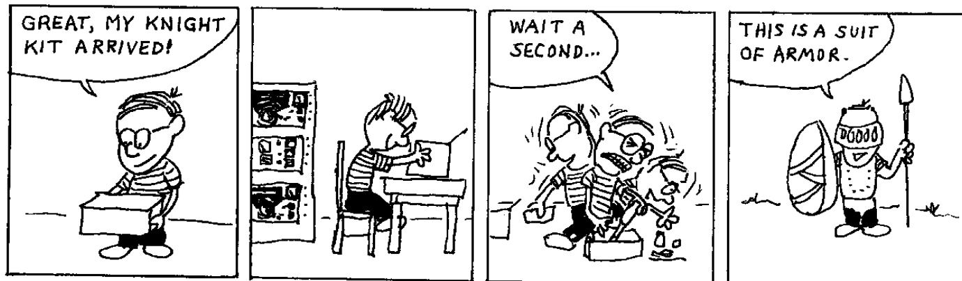
Via ARNS Bulletin