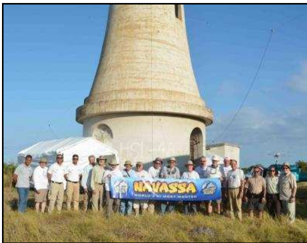
K1N team at Navassa Island lighthouse

The K1N Navassa Island DXpedition wrapped up on schedule early on Sunday, February 15. While some seekers went away empty handed — even after hours of trying to break the massive pile-ups (and some intentional interference) — thousands were more fortunate. Going into the DXpedition, Navassa Island (KP1) was the second most-wanted DXCC entity (after North Korea) on ClubLog's Most Wanted List. After starting up in the waning hours of February 1, K1N logged 138,409 contacts with 35,702 unique call signs. The final K1N contact was made on February 15 at 1127 UTC.