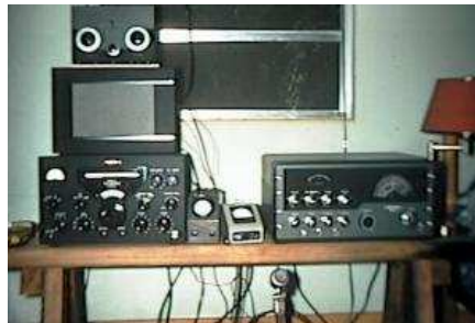
The picture shows the new re-

When I got the HT-32 SSB transmitter, I went on the air with it on June 22, 1957, the first SSB station in Raleigh and Wake County! There were a lot of AM'ers that didn't like the 'Donald Duck' sound and the old receivers didn't either. There wasn't an easy or quick way for them to 'decode' the 'garble' on the old receivers! I almost got run out of town!