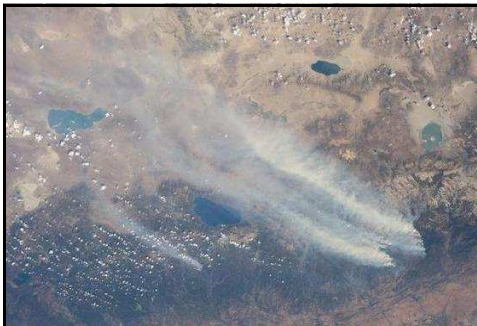
One of the Expedition 36 crew members aboard the International Space Station used a 50 mm lens to record this view of the massive drought-aided Rim Fire in and around California's Yosemite National Park and the Stanislaus National Forest on August 26.

ham community," and volunteers have been putting in "some long days." The Red Cross is sheltering on the order of 100 evacuees.