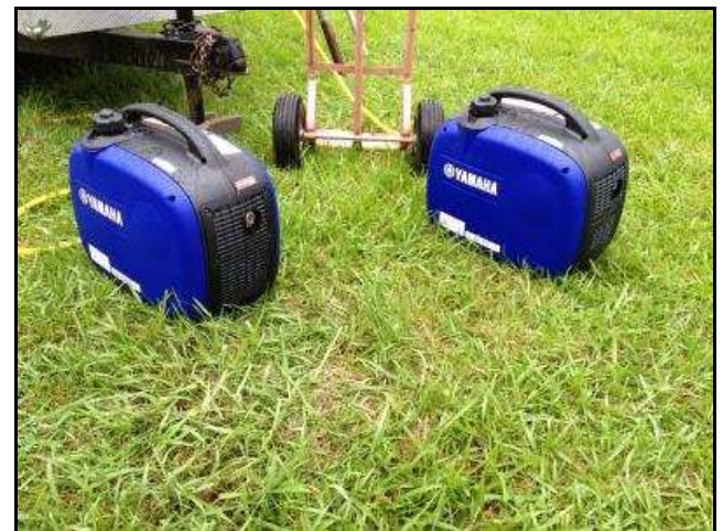
Two new engine generators