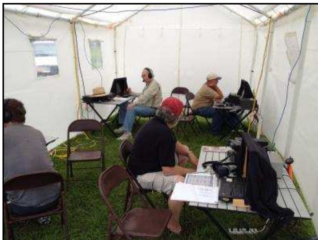
Three stations plus GOTA ( G et O n T he A ir)