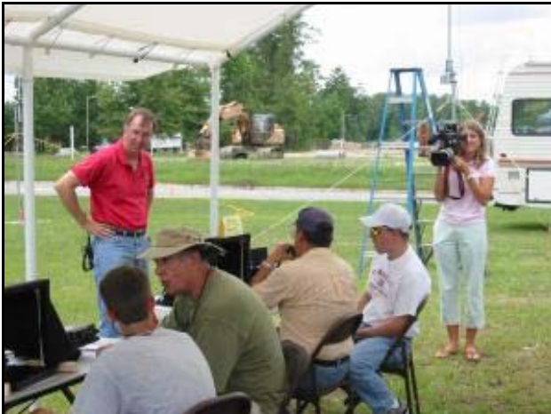
WITN-TV, Channel 7 reporter taking videos of the contest operators. It was on the 6 PM News.