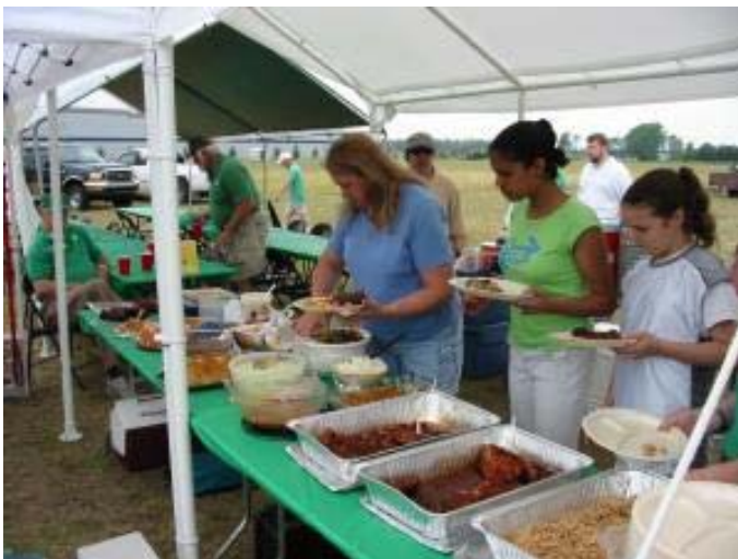
It's time to enjoy the good food!