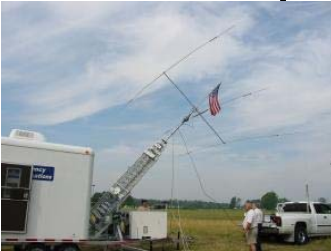
Hydraulics raising the tower on EG ARES trailer.