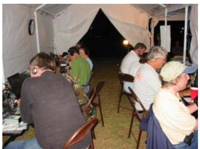
Nighttime operators keep the 3A stations and GOTO busy.