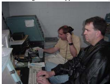
N8FF and KG4ZVM