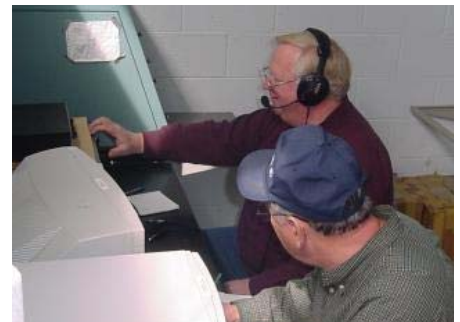
KD4MTT and K4MHM