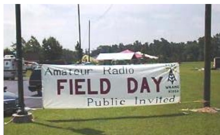
BARC Field Day 2001