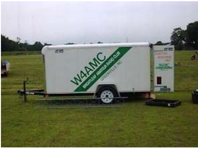
The Brightleaf Amateur Radio Club's new utility trailer on site with equipment for Field Day.