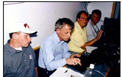
KG4CCX, KV4CN, KF4VHH and KS4YF at W1VOA