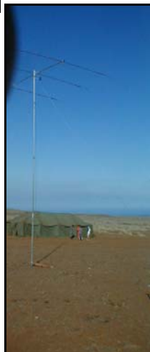
Beam in Hawaii