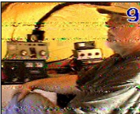
SSTV picture of KQ2V/KH6 received at W1VOA. QRM can be seen.