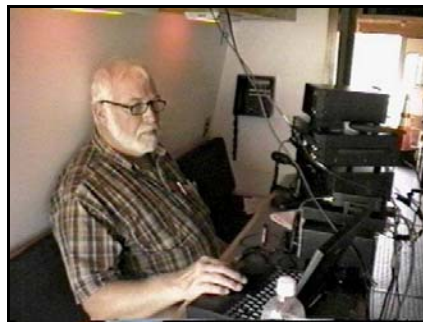
K4ROK checking out W1VOA