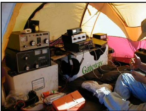
KQ2V/KH6 station in Hawaii